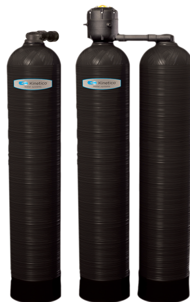
Kinetico Model 1060 Dechlorinator Combination (additional configurations available)